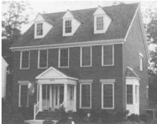
Reinforced Brick Masonry Single Family Residence, Ashbrun VA FIG. 6

Structures of all sizes, from single story residences to 23 story buildings have been constructed of reinforced brick masonry as shown in Figs. 6 and 7.