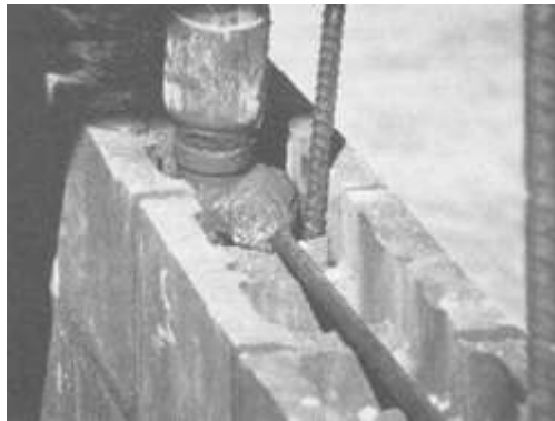
Reinforced Hollow Brick Masonry FIG. 4

The most recent means of constructing reinforced masonry incorporates hollow brick. These units are manufactured with large open cells which align vertically when the units are laid. Vertical reinforcement is placed in the cells by laying the brick over or around the bars, or by threading the bar in after the brick are laid. Horizontal reinforcement is placed in bed joints or in continuous bond beams made by removing portions of the webs that connect the face shells. Spaces containing reinforcement are grouted in lifts of up to 5 ft (1.5m) to make grout pours of up to 24 ft (7.3m). Construction of reinforced hollow brick masonry is shown in Fig. 4