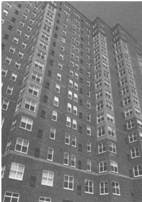
Reinforced Brick Masonry High Rise, Cleveland, OH FIG. 7

The applications range from retaining walls to exterior cladding. The added tensile strength of the reinforcing steel opens the possibility for prefabricated brick panels. This method of design and construction is utilized frequently to achieve unusual shapes and bond patterns in brick masonry. See Fig. 8.