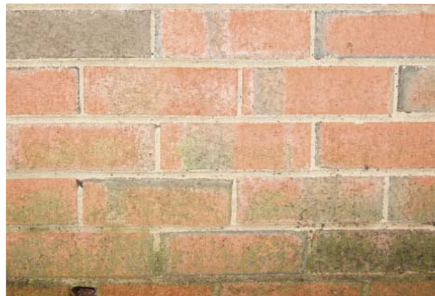
Photo 11 Organic Stain