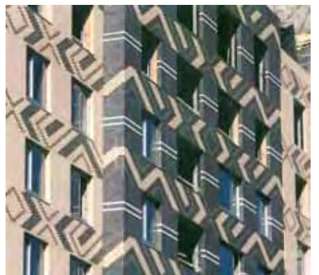
Figure 2. Using brick with different color and texture within brickwork – The Kalahari ©Frederic SCHWARTZ Architects

Extrusion. In the stiff-mud or extrusion process, the clay is pushed through a steel die to produce a continuous rectangular "column" of clay with crisp, angular edges.