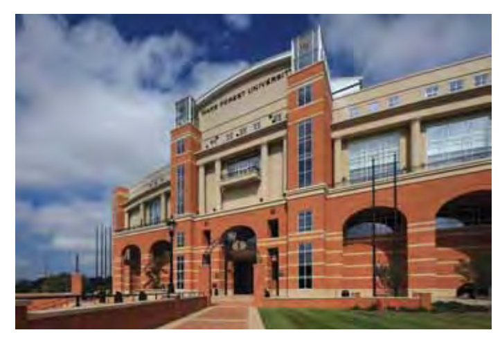
Figure 5. Bands of Other Materials – Deacon Tower ©Jim Sink Photography/Walter Robbs Callahan & Pierce Architects, PA

When possible, accent bands in brick masonry should be made of brick. Different colors, shapes and textures, as well as bands which include different bond patterns and orientations, can be used to provide interest to the brickwork. Variations such as these may result in cost savings over bands of other materials. However, it is important that the dimensions of the brick of different colors or brick from different manufacturers be compatible. Units that do not have compatible dimensions must have the difference compensated for with a different thickness of mortar joints.