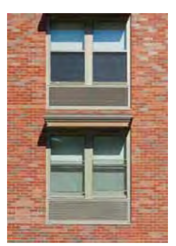
Figure 3. Blended or Mingled Brick -97 Crooke Avenue

Blending or "Mingling" Brick. Another method to achieve a wider array of colors within field brick is to mix or "mingle" two or more brick or blends of brick (see Figure 3). Blending or "mingling" brick offers an architect the means to combine several colors or blends of different brick within the same wall to create a unique look for a building. When selecting blends of brick for blending or mingling together for a project, it is often helpful to dry stack several walls using the same blends or colors of brick but vary the percentage of each included. For example, constructing a wall by blending 40% of brick color #1 and 60% of brick color #2 together could be compared to an adjacent wall that is built by blending 30% of brick color #1 and 70% of brick color #2. This technique has been used successfully