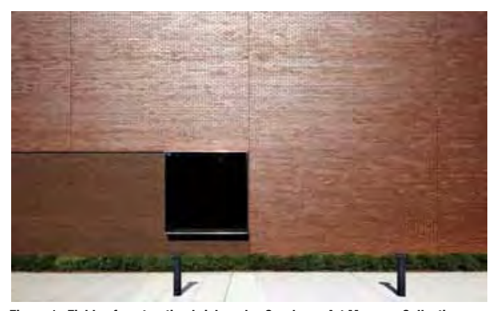
Figure 1. Fields of contrasting brickwork - Cranberry Art Museum Collections Building

The different colors and textures of brick are achieved by manufacturers in several ways. Most finishes are applied prior to the brick entering the kiln, but some finishes are applied after the brick have exited the kiln. Varying the color and texture of brick in a wall can create contrast in brickwork as shown in Figures 1 and 2.