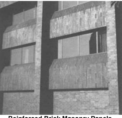
Reinforced Brick Masonry Panels FIG. 8