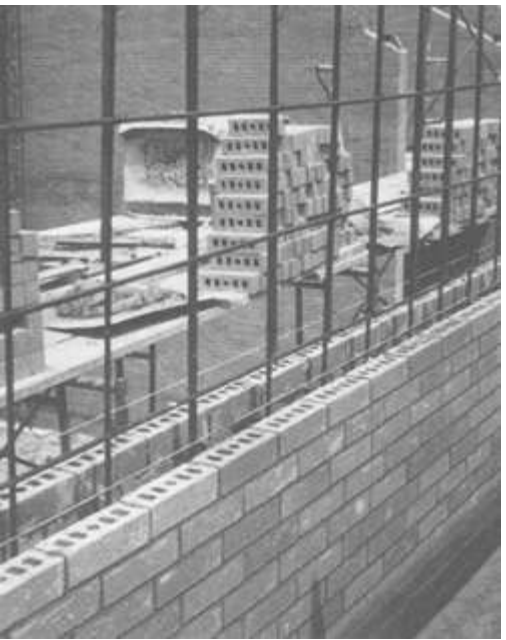
Double Wythe Reinforced Brick Masonry FIG. 3

The most recent means of constructing reinforced masonry incorporates hollow brick. These units are manufactured with large open cells which align vertically when the units are laid. Vertical reinforcement is placed in the cells by laying the brick over or around the bars, or by threading the bar in after the brick are laid. Horizontal reinforcement is placed in bed joints or in continuous bond beams made by removing portions of the webs that connect the face shells. Spaces containing reinforcement are grouted in lefts of up to 5 ft (1.5m) to make grout pours of up to 24 ft (7.3m). Construction of reinforced hollow brick masonry is shown in Fig. 4