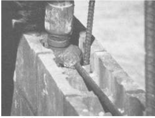
Reinforced Hollow Brick Masonry FIG. 4

The most recent means of constructing reinforced masonry incorporates hollow brick. These units are manufactured with large open cells which align vertically when the units are laid. Vertical reinforcement is placed in the cells by laying the brick over or around the bars, or by threading the bar in after the brick are laid. Horizontal reinforcement is placed in bed joints or in continuous bond beams made by removing portions of the webs that connect the face shells. Spaces containing reinforcement are grouted in lefts of up to 5 ft (1.5m) to make grout pours of up to 24 ft (7.3m). Construction of reinforced hollow brick masonry is shown in Fig. 4