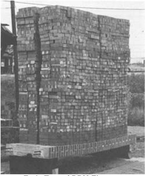
Early Test of RBM Element FIG. 2

sonry. Since 1924, numerous field and laboratory tests have been made on reinforced brick beams, slabs and columns, and on full size structures. Fig. 2 is an example of a 1936 test to demonstrate the structural capabilities of reinforced brick masonry elements.