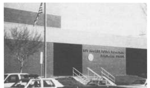
Los Angeles Police Department, Devonshire Station FIG. 1

Brick masonry is one of the oldest forms of building construction, and reinforcement has been used to strengthen masonry since 1813. In the modern sense reinforced brick masonry in the United States is a relatively new type of construction, with specific design procedures and construction methods. These have been developed from experimental investigations beginning in the 1920's and with the experience of the performance of thousands of reinforced masonry buildings. These structures demonstrate the practicality and economy of the construction, and their performance confirms the soundness of the design principles. Figure 1 shows the Los Angeles Police Department, Devonshire Station, a reinforced brick structure, located 3 miles (4.8 km) from the epicenter of the Northridge earthquake. There was no structural damage and the building reportedly functioned as an emergency services coordination center following the 6.7 magnitude earthquake.