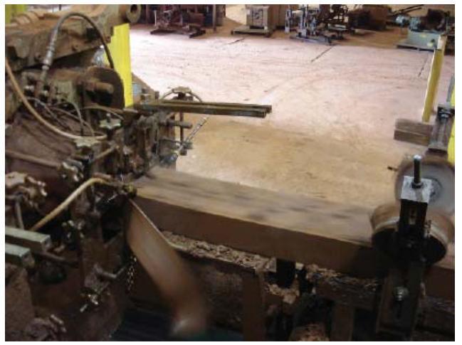
Photo 3 After Mining, Clay is Extruded Through a Die and Trimmed to Specified Dimension Before Firing

Preparation. To break up large clay lumps and stones, the material is processed through size-reduction machines before mixing the raw material. Usually the material is processed through inclined vibrating screens to control particle size.