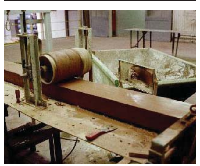
Photo 6 Some Brick Textures are Applied by Passing Under a Roller After Extrusion

Many manufacturing plants apply engobes (slurries) of finely ground clay or colorants to the column. Engobes are clay slips that are fired onto the ceramic body and develop hardness, but are not impervious to moisture or water vapor. Sands, with or without coloring agents, can be rolled into an engobe or applied directly to the brick faces to create interesting and distinctive patterns in the finished product.