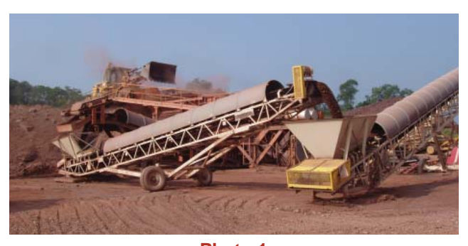
Photo 1 Clay or Shale Being Crushed and Transported to Storage Area

Continuous brick production regardless of weather conditions is ensured by storing sufficient quantities of raw materials required for many days of plant operation. Normally, several storage areas (one for each source) are used to facilitate blending of the clays. Blending produces more uniform raw materials, helps control color and allows raw material control for manufacturing a certain brick body.